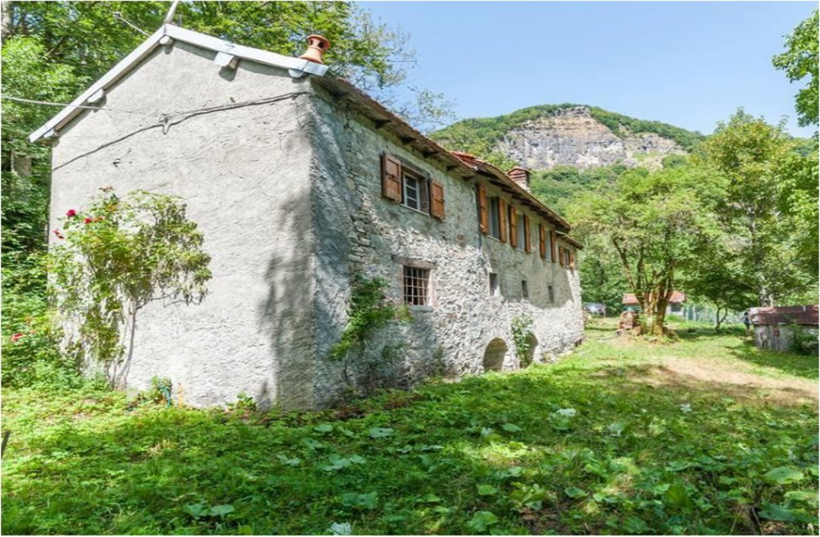
AND YOU'RE THERE!